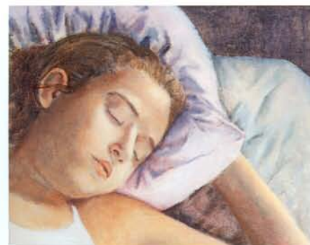
La voix passive , 2001 technique mixte - mixed media, 16" x 20"