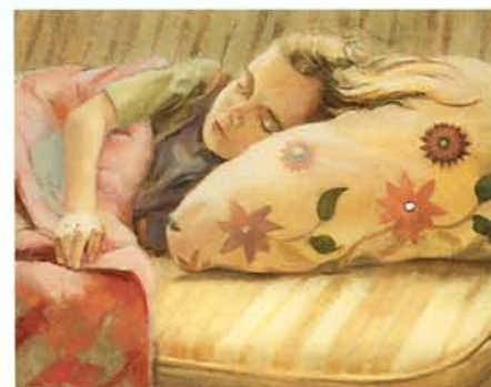
Sieste , 2001 technique mixte - mixed media, 16" x 20"