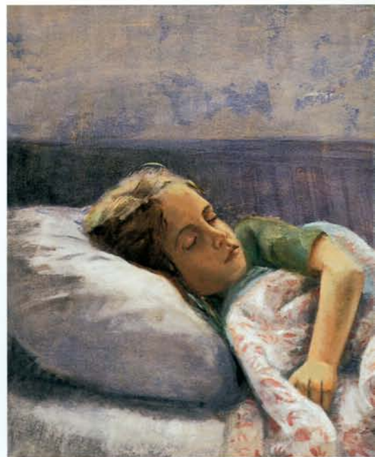
Le petit voyeur, 2001, technique mixte - mixed media, 42" x 56"