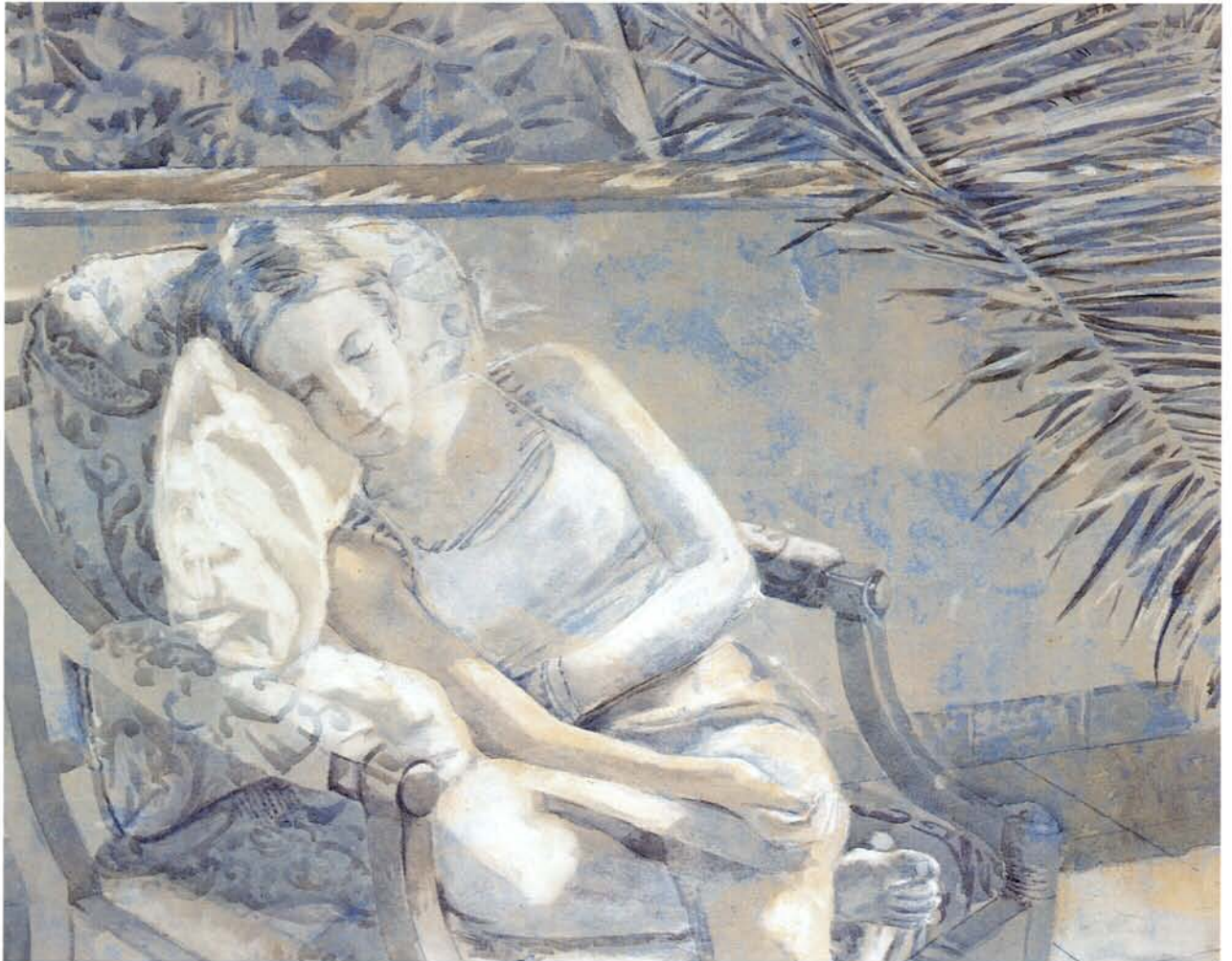
Luxury , 2001, technique mixte - mixed media, 40" x 50"

Vous êtes cordialement invité à assister au vernissage des oeuvres de SUSAN G. SCOTT le jeudi 14 mars de 17h30 à 19h30. L'artiste sera présente. Exposition et vente en cours. L'exposition se poursuivra jusqu'au 25 mars, 2002.