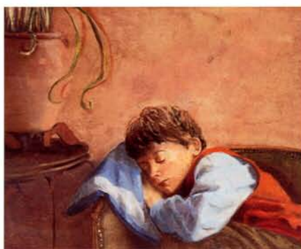
Demi-sommeil , 2001 technique mixte - mixed media, 20" x 25"