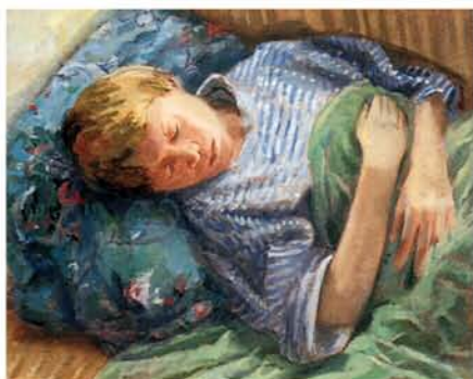
Deep Nap , 2001 technique mixte - mixed media, 16" x 20"