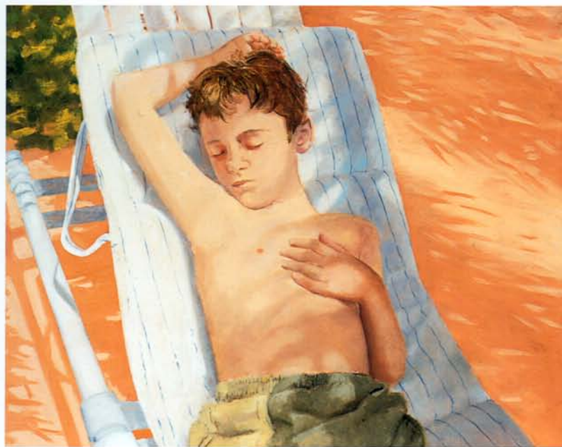
Passage tranquille, 2001, technique mixte - mixed media, 40" x 50"