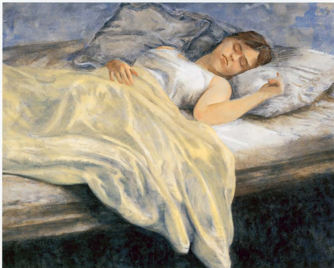
Nuit blanche , 2001, technique mixte - mixed media, 52" x 62"