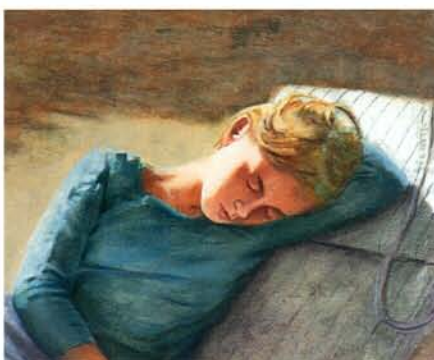
Sommeil inapprêté , 2001 technique mixte - mixed media, 20" x 25"