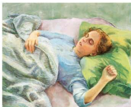
Winter Sleep , 2001 technique mixte - mixed media, 20" x 25"

L'artiste remercie la Concordia University Part-time Faculty Association (CUPEA) pour la bourse d'achat de matériel appliquée à la production de ces oeuvres. The artist would like to thank the Concordia University Part-time Faculty Association (CUPFA) for a special grant received to purchase her materials towards the production of these paintings.