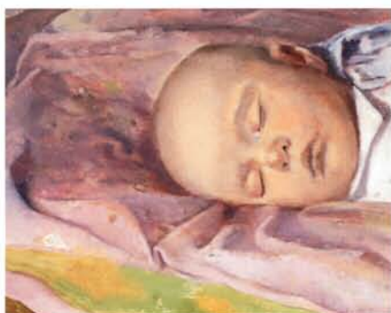
Passage libre , 2001 technique mixte - mixed media, 16" x 20"