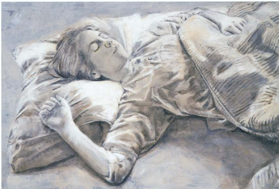
White Rest , 2001, technique mixte - mixed media, 42" x 60"