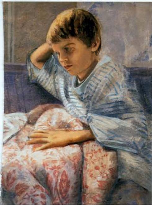
...te - mixed media, 30" x 46"