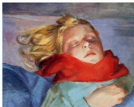
Red Scarf , 2001 technique mixte - mixed media, 16" x 20"