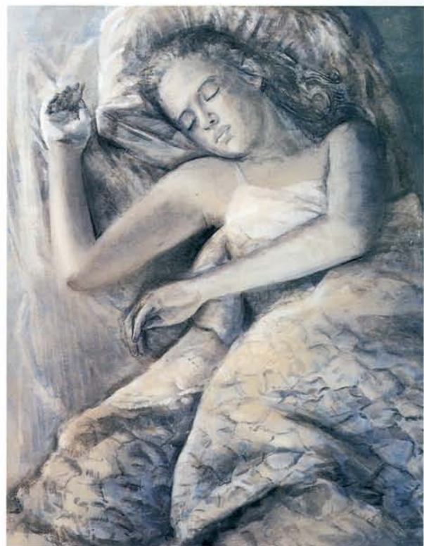
Sommeil aimable, 2001, technique mixte - mixed media, 50" x 40"