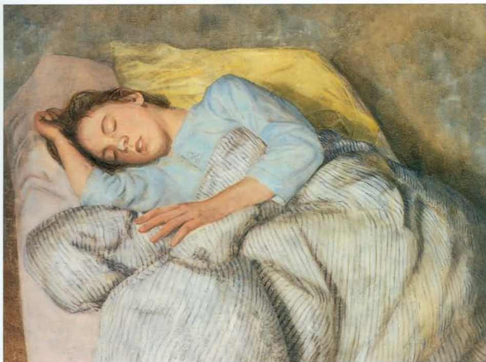
Still at Rest, 2001, technique mixte - mixed media, 42" x 56"