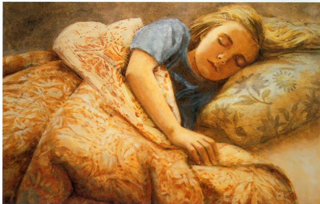
Repos d'or, 2001, technique mixte - mixed media, 30" x 46"