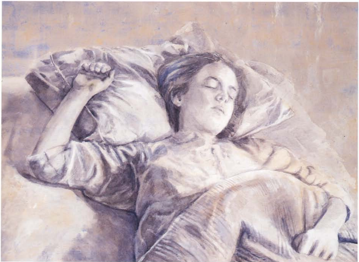
White Rest #2 , 2001, technique mixte - mixed media, 48" x 66"