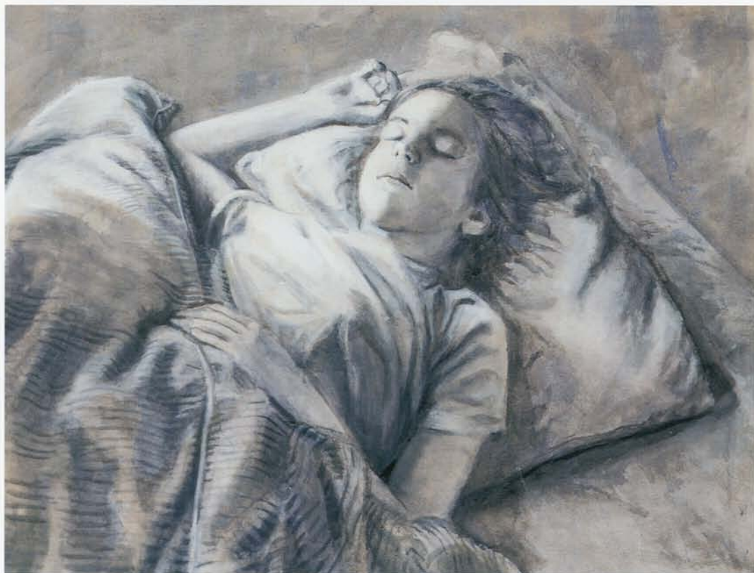
White Rest #4 , 2001, technique mixte - mixed media, 47" x 60"