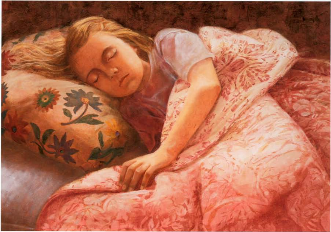
Dodo , 2001, technique mixte - mixed media, 44" x 62"