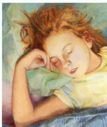
Air de défi , 2001 technique mixte - mixed media, 16" x 14"