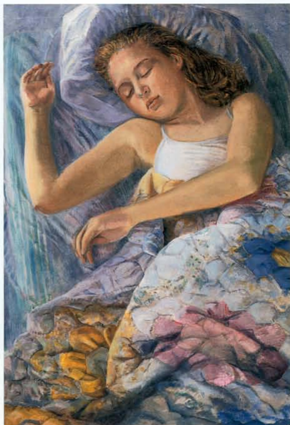
Sommeil adorable, 2001, technique mixte - mixed media, 60" x 42"