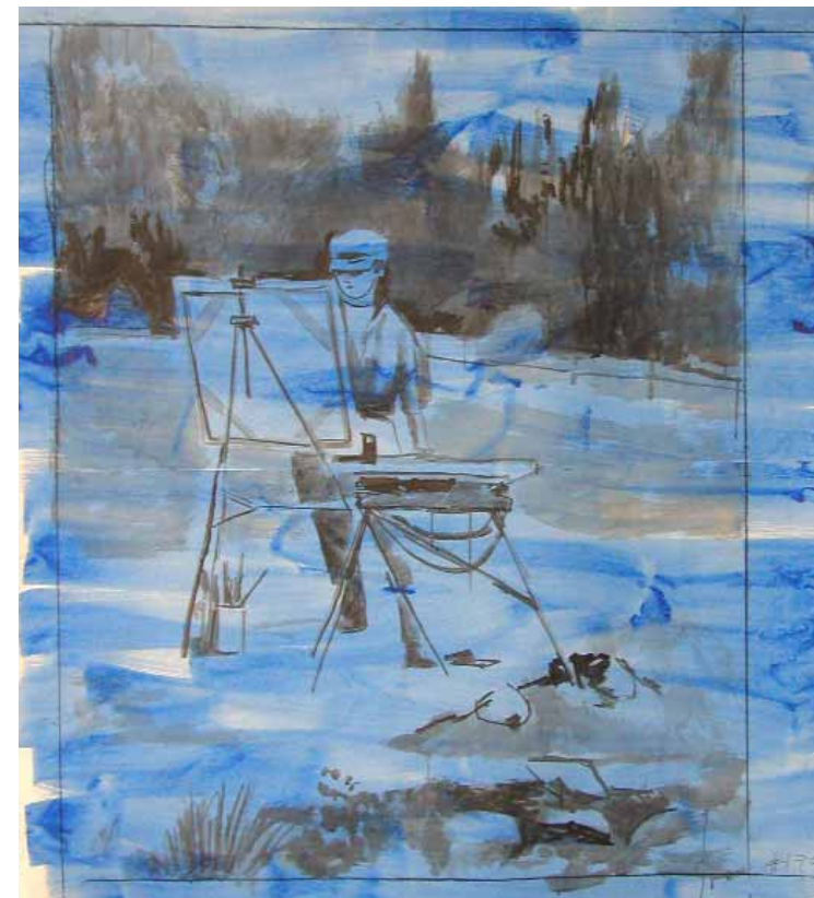
Blue Landscape (study)