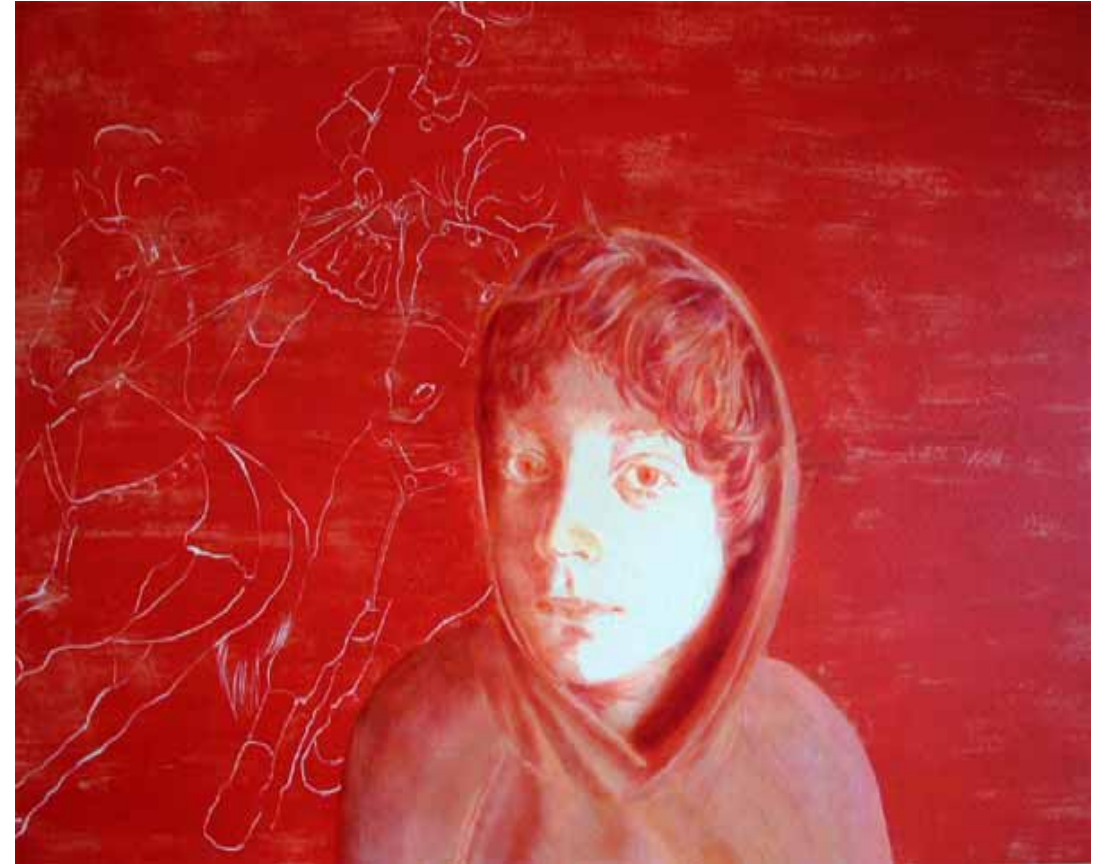
Red boy with rider

2003 Oil on Canvas 101.6 x 127 cm 40 x 50 in.