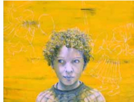
Click and Clack 2005 Mixed media on Canvas 101.6 x 127 cm (40 in. x 50 in)

2005 Mixed media on Canvas 101.6 x 127 cm 40 x 50 in.