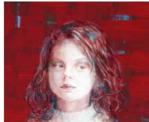
Plum 2005 Mixed media on Canvas 40.64 x 50.8 cm (16 in. x 20 in)