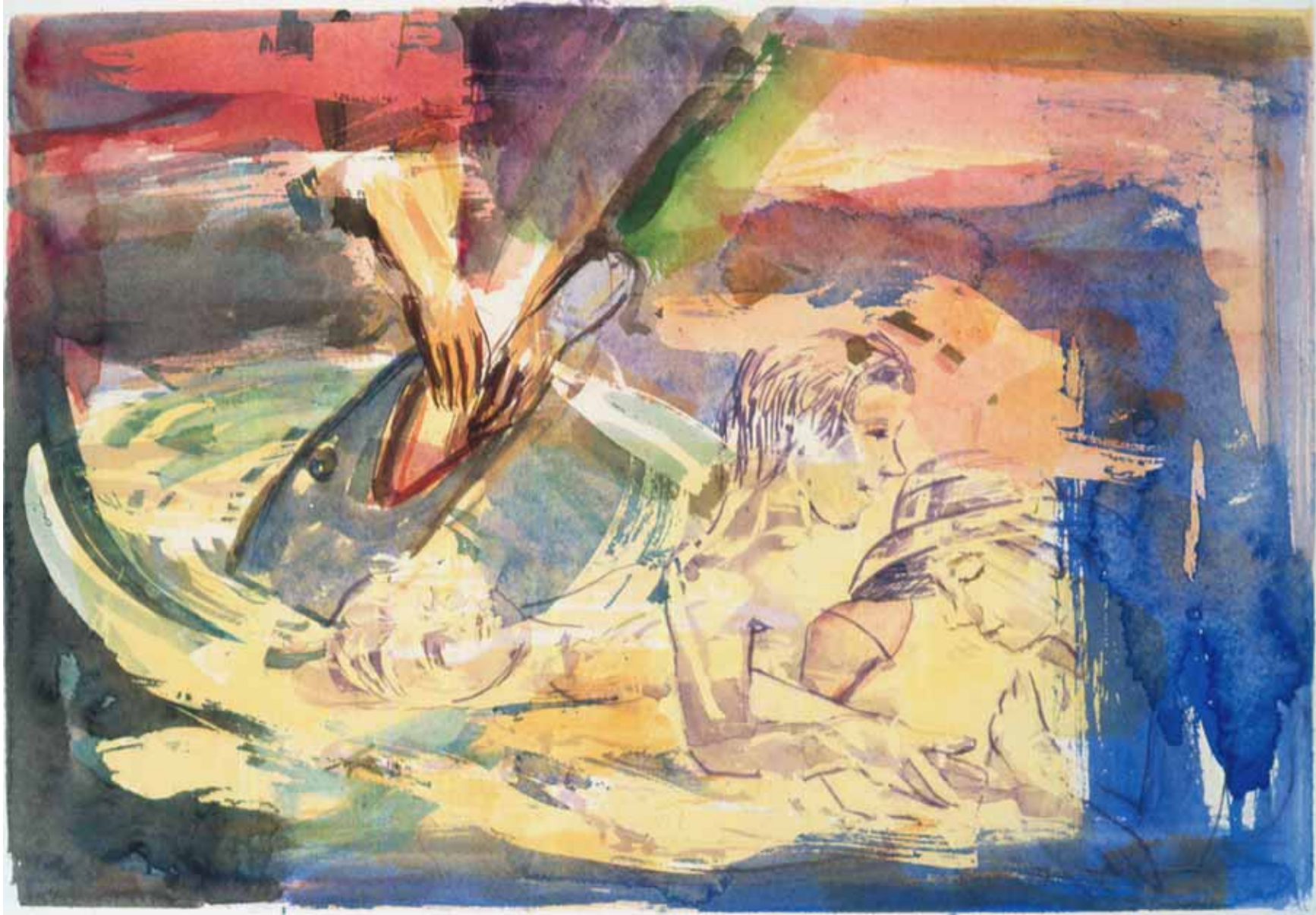
Fabula #27, 2004

Mixed Media on Paper, 55.88 x 76.2 cm ( 22 x 30 in.)