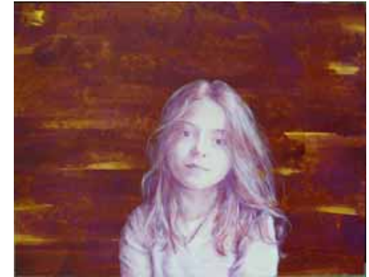
Hannah 2005 Mixed media on Canvas 101.6 x 127 cm (40 in. x 50 in)