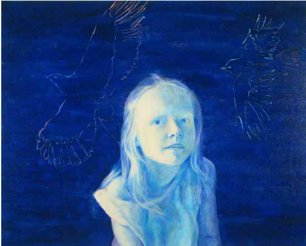
Blue Girl with birds

2003 Oil on Canvas 101.6 x 127 cm 40 x 50 in.